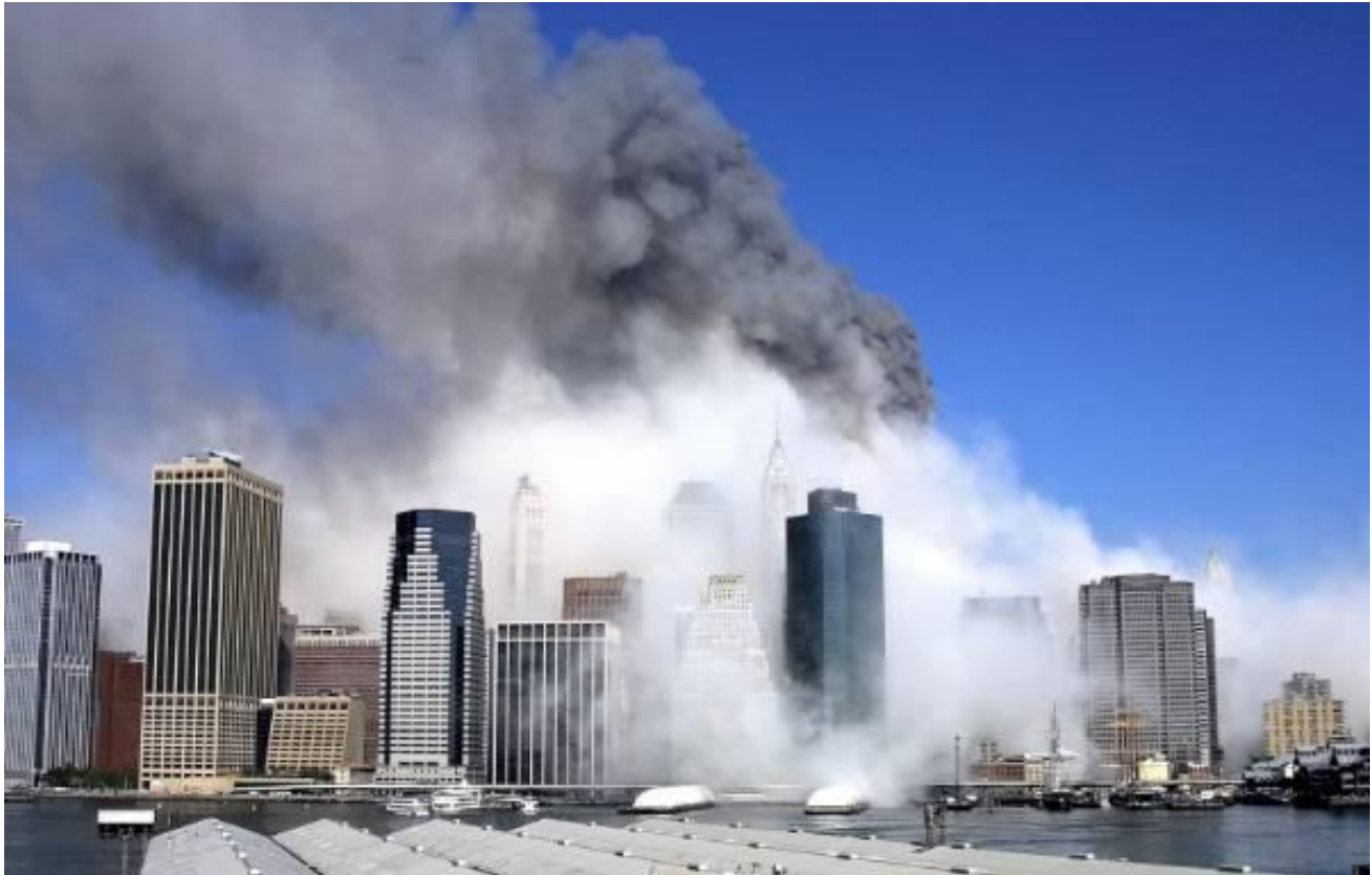
Figure 76. (9/11/01)

Note the two-toned coloration. This does not look normal.