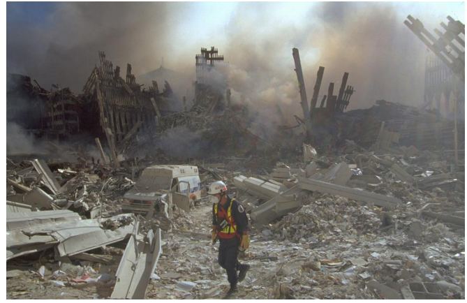
Figure 87. (9/13/01, likely taken on 9/11/01) Source 010913_5316.jpg

WTC6, an 8-story building, towers over the "rubble pile" remaining from WTC1 and 2. We know this photo was take before noon on 9/11/01. WTC7 can be seen in the distance. The Verizon Building is at a distance on the left.