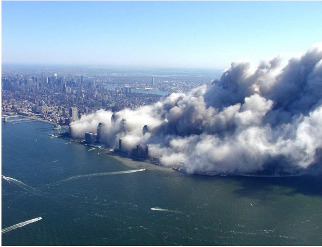
Figure 83. GJS-WTC046.jpg