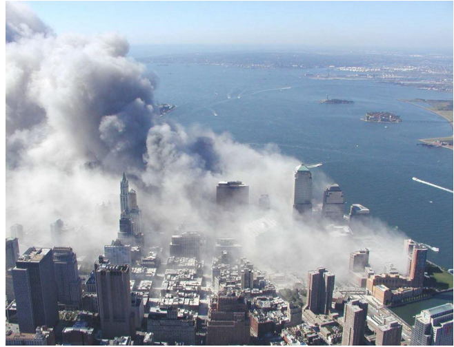
Figure 84.

The dust from blowing up the Kingdom rolled out and settled down in less than 20 minutes.