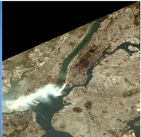
Figure 78. (9/12/01)