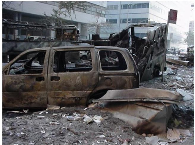
Figure 98. (9/11/01)

Burned out cars and bus along West Broadway. Consistently, they seem to have missing door handles. And the gas tanks don't appear to explode, but several engine blocks appear to disintegrate.