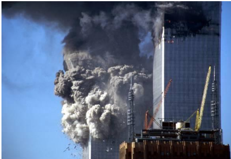
Figure 77. (9/11/01) Source Image252.jpg

Note the two-toned coloration. This does not look normal.