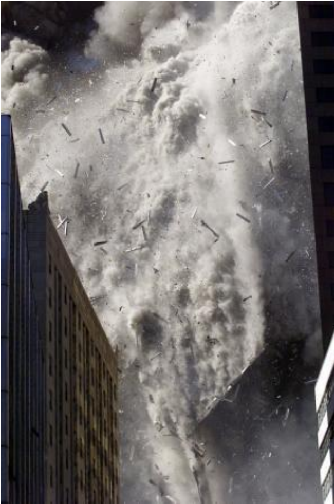
Figure 93. (9/11/01) Source: Shannon Stapleton, Reuters http://upload.wikimedia.org/wikipedia/en/c/c5/DustifiedWTC2.jpg