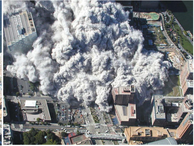
Figure 80.

This is the rollout of the dust cloud from WTC1. The dust on the pavement in front of the cloud shows the dust from WTC2 stopped about one block before the pedestrian bridge. The dust cloud from WTC1 stopped at the pedestrian bridge, about the distance the WTC towers were separated by.