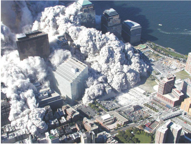
Figure 79. source http://911wtc.freehostia.com/gallery/originalimages/GJS-WTC32.jpg GJS-WTC032.jpg