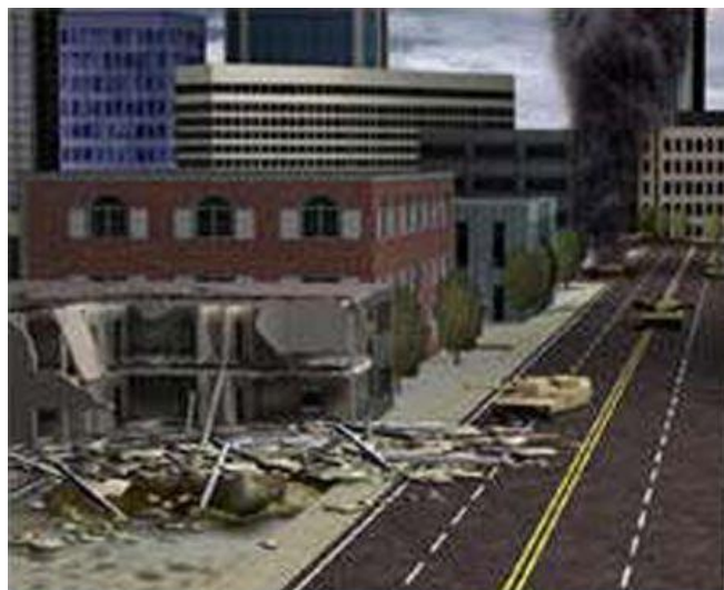
Figure 100(a). source defens1_poof_1.jpg

I think you will agree with me that the following photographic comparison is startling: