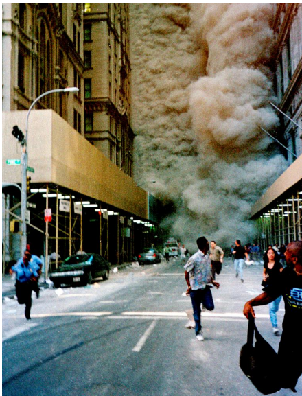
Figure 91. (9/11/01)