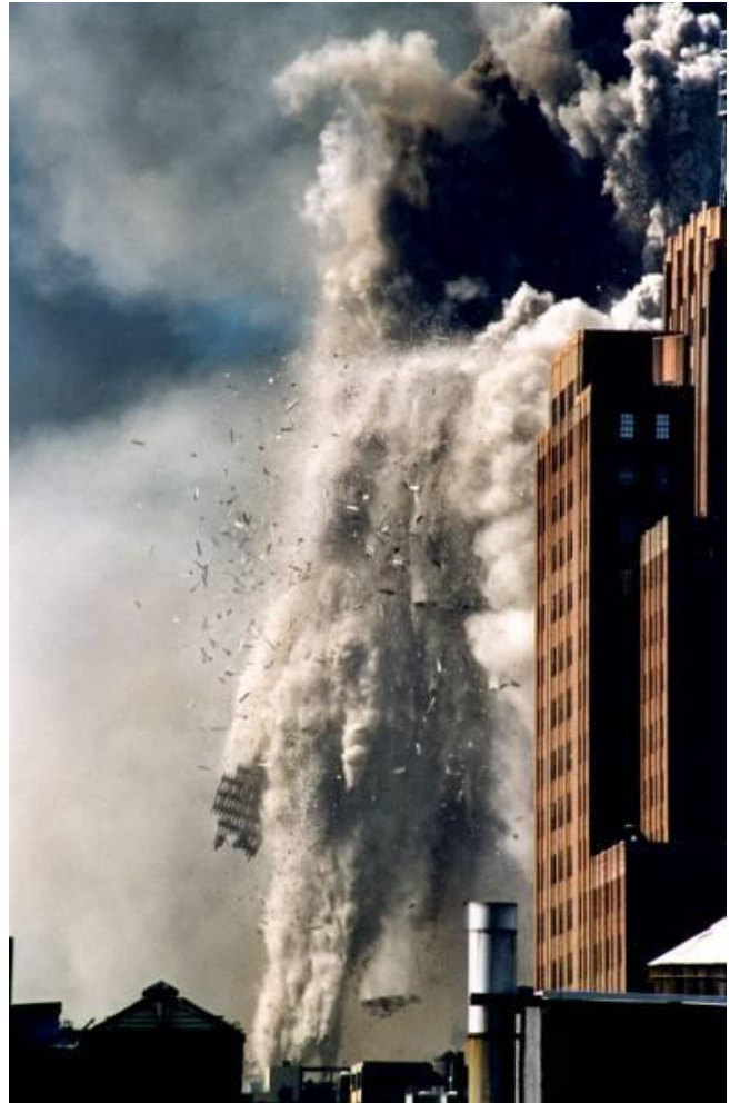
Figure 94. (9/11/01)