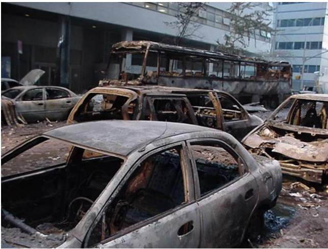
Figure 97. (9/11/01)