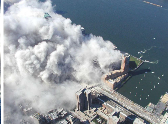
Figure 82. source http://911wtc.freehostia.com/gallery/originalimages/GJS-WTC43.jpg GJS-WTC043.jpg

The dust clouds appear to roll out for a certain distance and then go up.