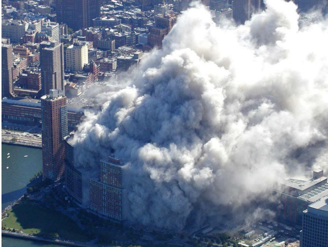
Figure 81.

This is the rollout of the dust cloud from WTC1. The dust on the pavement in front of the cloud shows the dust from WTC2 stopped about one block before the pedestrian bridge. The dust cloud from WTC1 stopped at the pedestrian bridge, about the distance the WTC towers were separated by.