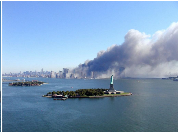
Figure 90. (9/11/01)

This is a ground-level view of the enormous quantity of dust wafting skyward. Conventional demolition dust does not do this.