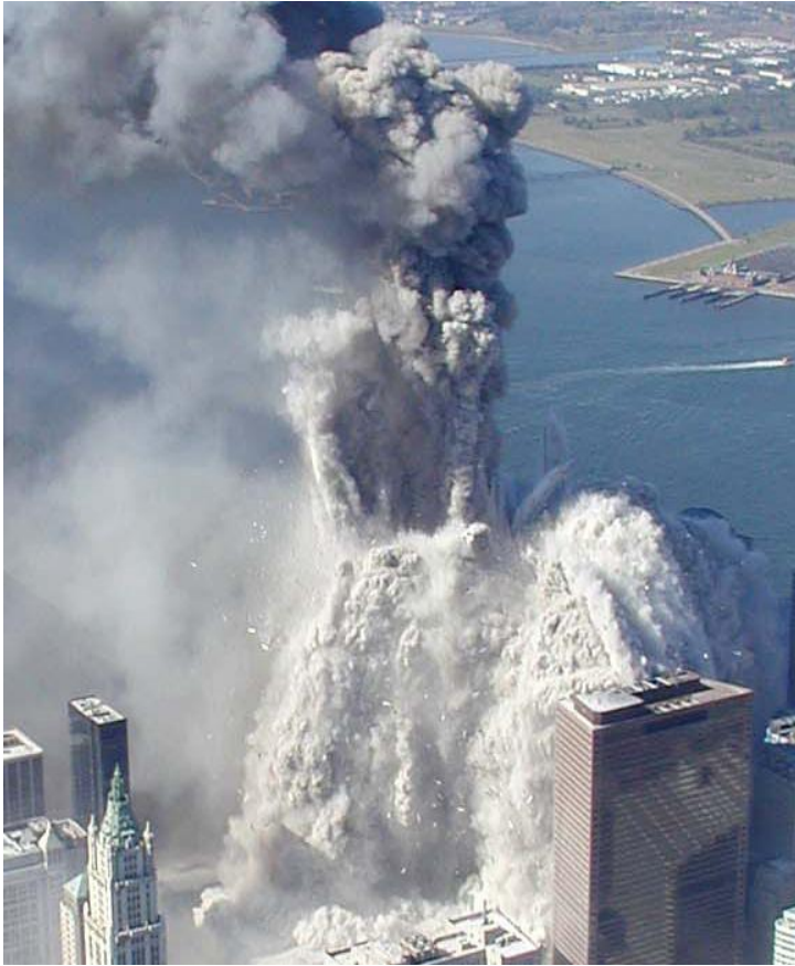
Figure 73. (9/11/01) Cropped from Source http://911wtc.freehostia.com/gallery/originalimages/GJS-WTC28.jpg bubbler.jpg