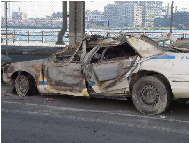
Figure 95.