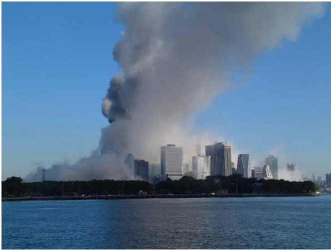
Figure 89. (9/11/01)

This is a ground-level view of the enormous quantity of dust wafting skyward. Conventional demolition dust does not do this.