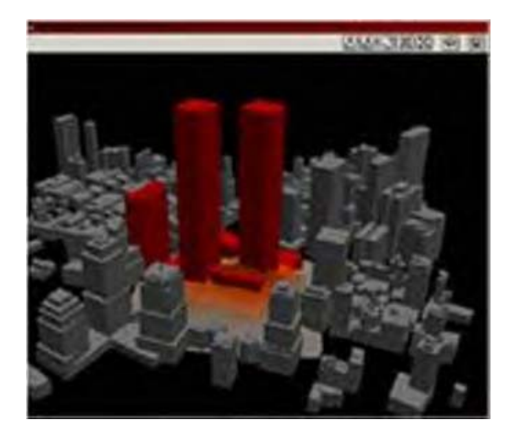
ARA does not say what message or information it seeks to impart in the above depictions found on their website.