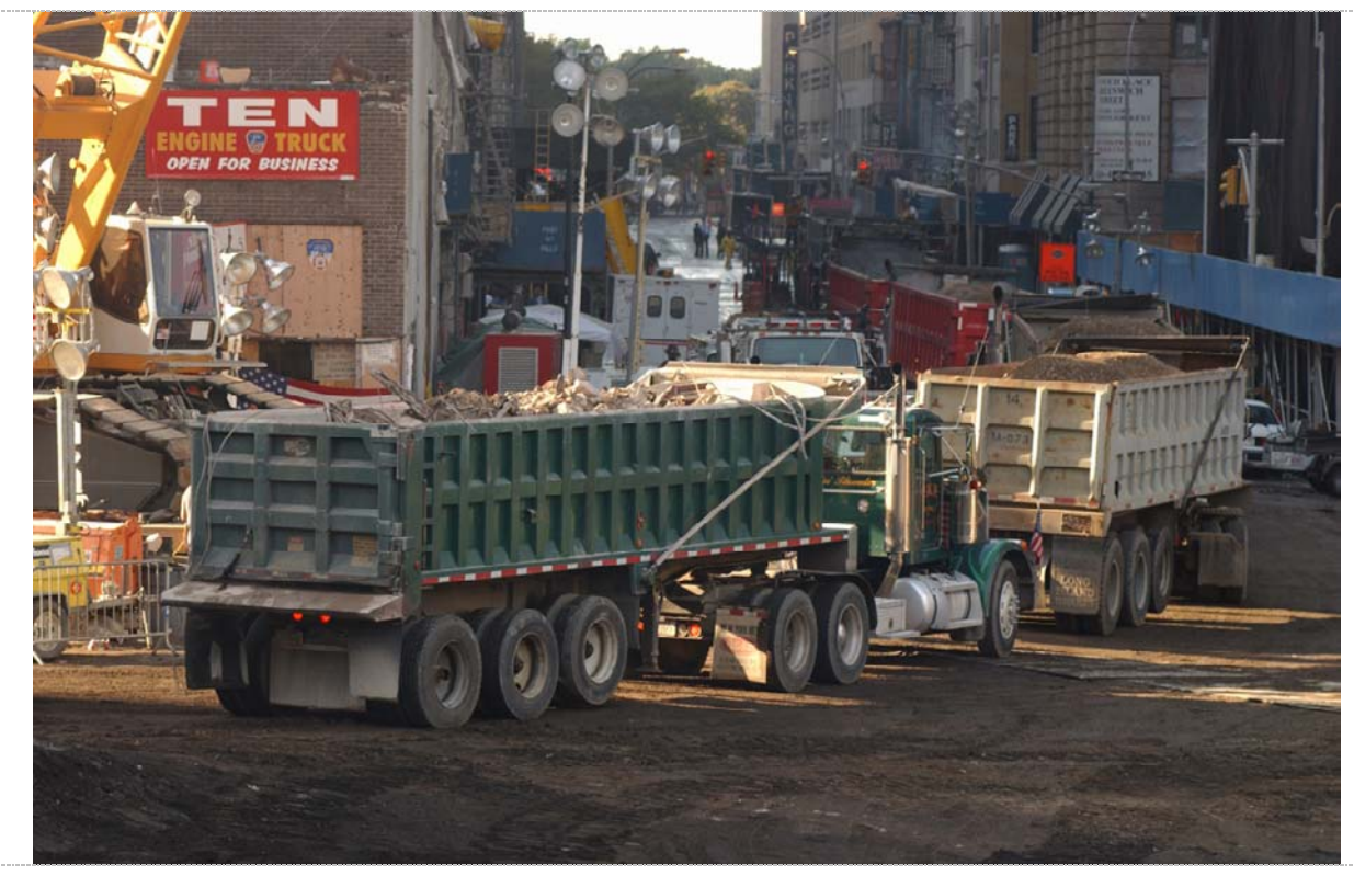
Figure 103(a). This appears to be dirt being trucked away from the WTC complex. Why is so much dirt coming and going? The four trucks ahead of the green one carry a uniform load of what appears to be dirt. (10/13/01)