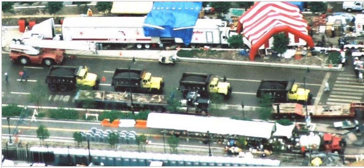
Figure 102(a). The four yellow dump trucks are heading south on West Street, toward the WTC complex. Each of the dump trucks carries a uniform load of what appears to be dirt. (9/27/01)