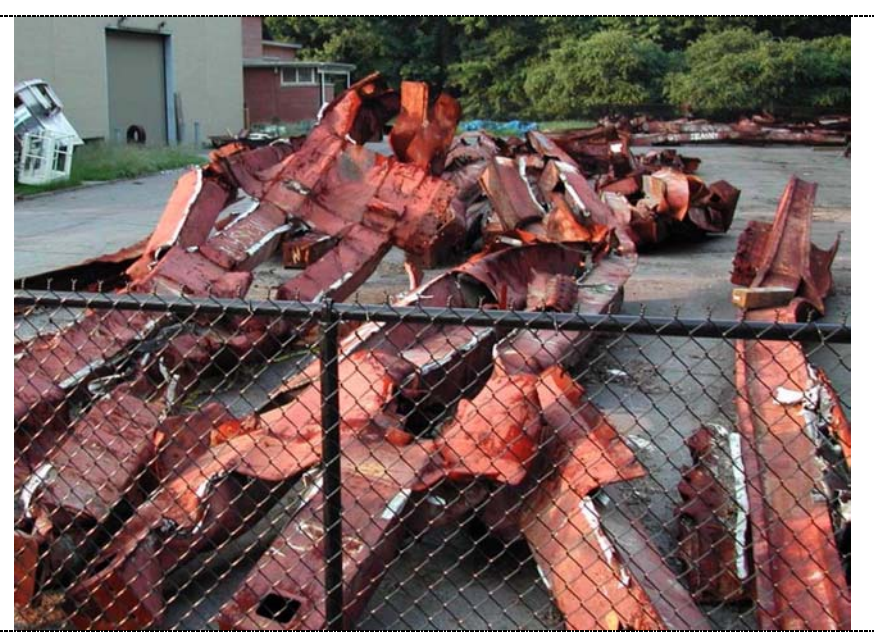
Figure 160. WTC beams with spandrel plates wilted like tissue. (9/05): NCSTAR1-3c-P187_carpet_c.jpg