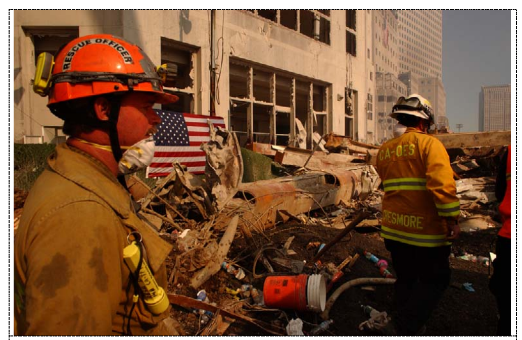
Figure 161. Bringing in dirt. (9/16/01)