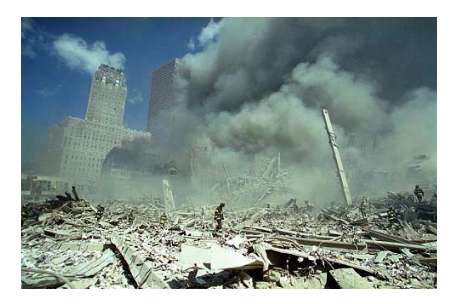
"Experimental evidence is the truth theory must mimic."

Where did the buildings go? Where is all the material for 110 floors of steel and concrete? Poof!