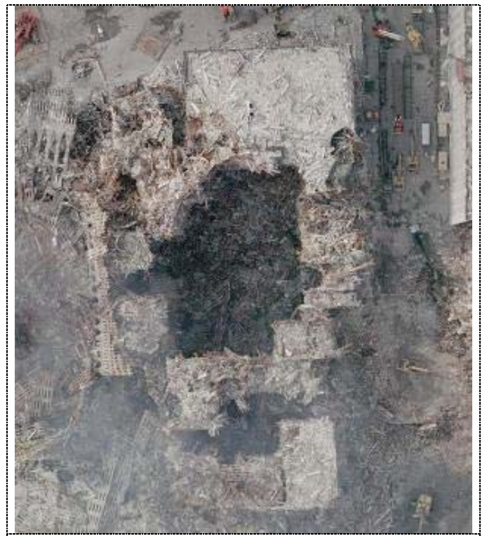
Figure 158. wtc6aerial.jpg (9/23/01)