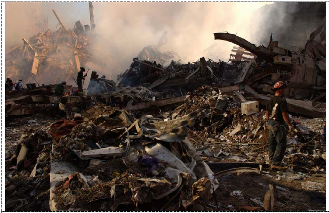
Figure 89. Why would there be dirt sprinkled on top of the rubble pile? The dirt arrived quickly. Is this from a landfill? (9/13/01 entered)

In fighting fires, they may drop loads of dirt on the fire from a chopper. In any case, this will be their cover story. But... we never saw any flames to put out. So, they still have some explaining to do.