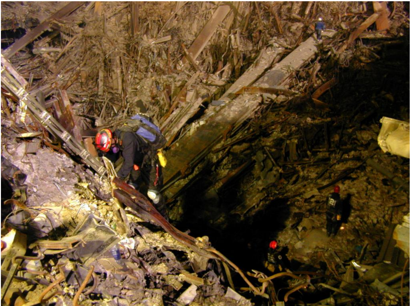
Figure 17. GZ workers descend into the subbasements below WTC2. While there is extensive damage, there is little building debris at the bottom of the hole. There is no sign of molten metal. A worker in the distance walks along a massive core column. There is little to no material in these holes. (photo filed 9/18/01)